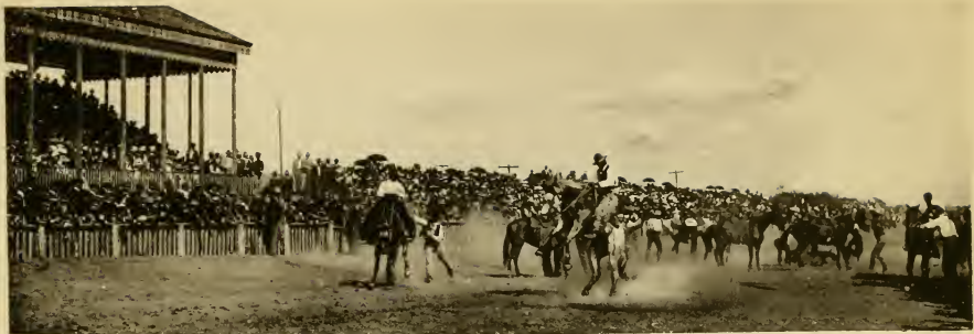
START OF THE WILD HORSE RACE.